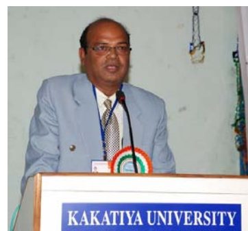
Director, CFRAC, KU